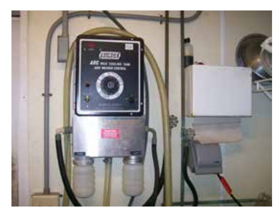
The control panel for the bulk tank has a constant temperature reading of the temperature of the milk in the bulk tank and runs the automatic wash system for the bulk tank.

Good brushes, proper water temperature, and the right cleaning materials reduce the effort and increase effectiveness in cleaning and sanitizing milk equipment. Bacteria need three conditions for support of growth – soil (food), moisture, and proper temperature. Proper cleaning and sanitizing followed by rapid drying removes these