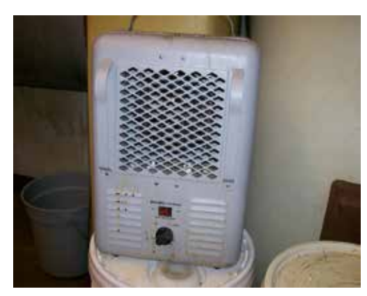
A space heater may be used during the winter in the milkhouse to keep pipes from freezing.