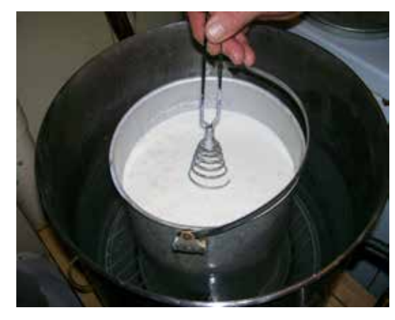
Milk should be stirred occasionally when it is being pasteurized to maximize the killing of harmful bacteria. Heat milk to 161 degrees F and hold it there for 15 seconds.

the spread of a disease is much easier than curing