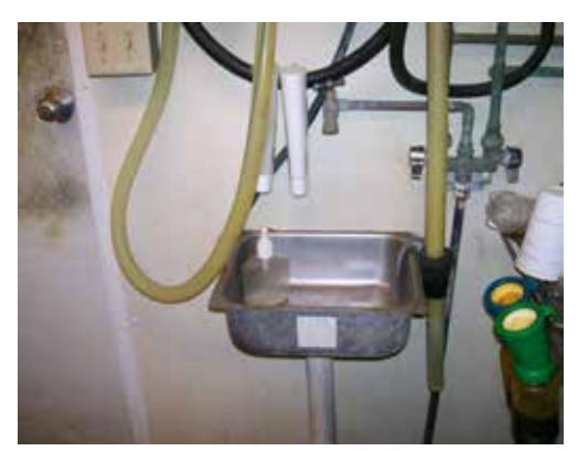
A separate sink should be available for washing hands of the milkers. The two sinks used for washing and sanitizing equipment may not be used for this purpose.

Work with your dairy equipment supplier to select a bulk tank that will best fit your needs. The lowest volume of milk must also be taken into consideration. There must be at least enough milk to cover ½ of the paddle after one milking to correctly cool your milk.