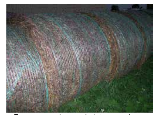
Forage may be made into round bales and stored in a line outside.

Due to their critical role in the health and production of the doe, as well as their significant cost, managing your feeds and rations should be central to your operation. Over the course of her life, feed will be the main cost of this doe. A correctly balanced ration is the key to maximizing milk production and the health of your milking doe.