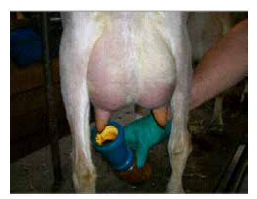
The pre-dip helps reduce bacteria counts in the milk.

Step 2. Forestripping . Use a strip cup to milk into. This technique is the only method to detect mild clinical mastitis. Early detection of mastitis is important to successfully treat it. The highest bacteria and somatic cell counts are in the teat cistern. Thus, forestripping into a strip cup can reduce bacteria.