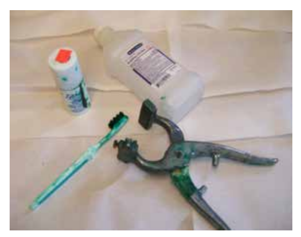
Supplies that are necessary for tattooing include the tattoo tongs with numbers and letters, tattoo ink, rubbing alcohol, towels and a toothbrush. A tattoo is a form of a permanent identification. Tattoos are placed in the ears of all of the breeds of goats except for the Lamancha breed. The tattoo is placed in the tail web of the Lamancha.

Goats are curious by nature; thus using nonpermanent identification may be a challenge. Ear