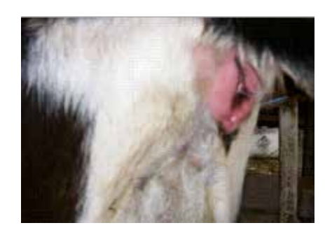
Vaginal drainage for the first days after kidding is normal.

The transition from a dry doe to a fresh doe is a very stressful time for the doe. It will take two or