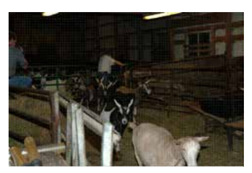
A dairy goat herd is often made up of more than one breed.

Sable Saanens are a newly recognized breed who have Saanen ancestry but come in a variety of colors, usually white with black or brown. They have similar production traits to white Saanens.