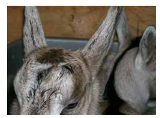
Kids should be disbudded between 3 and 14 days of age, while the horn bud is visible.

Proper ventilation will prevent respiratory problems. Keeping pens clean and dry will help to eliminate other health issues. An excellent nutritional program will not make up for unsanitary, poorly ventilated, drafty environments.