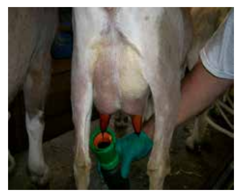
Post dip helps to reduce the bacteria found on the teat skin.

Step 5. POST DIP. Use a quality commercially prepared product that is compatible with the predip. The purpose of the post dip is to reduce the bacteria found in the milk film on the teat skin. This is also a fundamental aspect of the control of contagious mastitis.