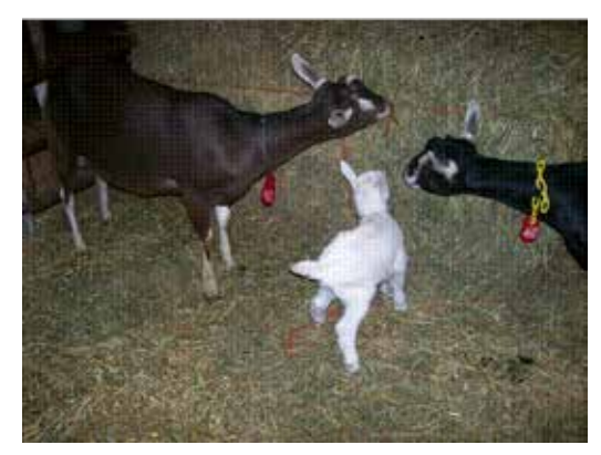
The future productivity of a doe depends on her care as a fetus and newborn kid.

The price that is given for milk is for 100 pounds. Thus if the price of goat's milk is $27.00, you will receive $27.00 for every 100 pounds you produce or $.27 per pound.