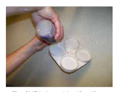
The CMT helps to identify milk with a high SCC.

stain test gives good somatic cell counts. Fossomatic results are usually higher and not as useful.