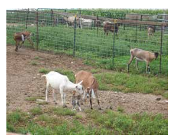
A Saanen crossed with any other breed will usually produce an animal with a white coat. A Nubian crossed with a breed that has erect ears will produce an animal with airplane ears. Ears that are too long to be considered erect but are too short for a Nubian. They are somewhere in the middle of these two ear types.

PTI (Production Type Index) is a genetic index that combines production and type evaluations into one score. PTI's provide a comparison between bucks of a breed and are not expressed in pounds or points, as are PTA's. The Indexes are listed with a 2:1 production emphasis and a 2:1 type emphasis.