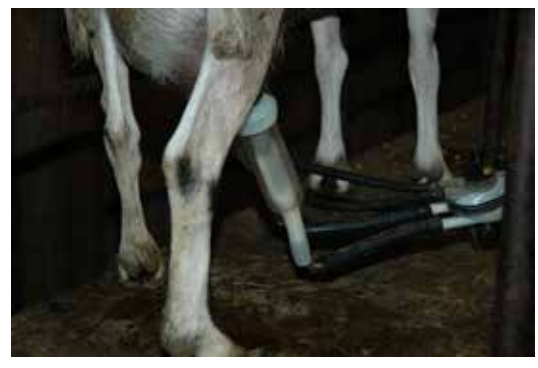
To determine your profit you must know your cost of producing 100# of milk.

Some plants have a two-tiered pricing system. A higher price is paid for winter milk than for summer milk. Each plant may vary a bit on what they consider summer months and winter months.