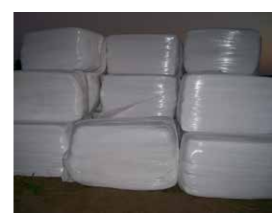
Determine the amount that you will have on hand at your maximum feed inventory and that will indicate the amount of space you will need for feed and bedding storage. Line wrapped baleage or individual wrapped bales of baleage will be stored outside.

Determine the amount that you will have on hand at your maximum feed inventory and that will indicate the amount of space you will need for