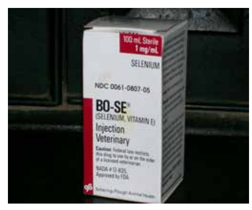
Check with your veterinarian to see if using a selenium-vitamin E supplementation also known as BOSE is an advisable management practice for your herd.

producing kids with problems. Cull poor producers and those with personality traits that make them a nuisance in the herd.