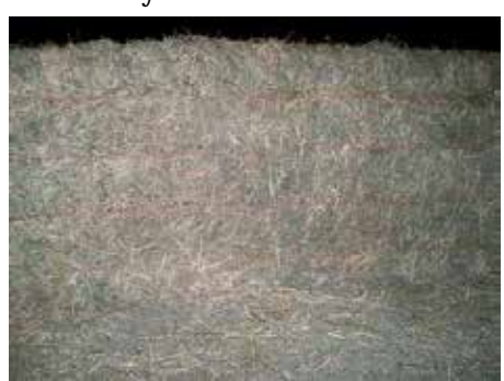
Large square bales must be stored inside.

Another available resource is the National