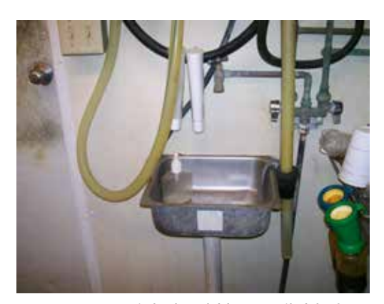
A separate sink should be available for washing hands of the milkers. The two sinks used for washing and sanitizing equipment may not be used for this purpose.

Work with your dairy equipment supplier to select a bulk tank that will best fit your needs. The lowest volume of milk must also be taken into consideration. There must be at least enough milk to cover ½ of the paddle after one milking to correctly cool your milk.