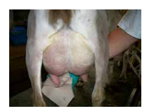
Dry the teats with a single use towel.

to dry. The towel must be dry. Do not dry several animals with the same towel.