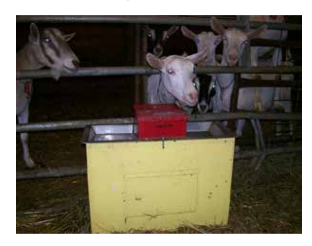
The automatic waterer keeps a supply of fresh water in front of the doe at all times. Be sure to clean waterers often.

Goats prefer warmer water and will decrease water intake below 41 degrees F water temperature.