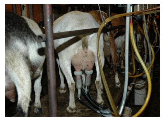
Monitor the milking of the fresh doe daily.

The first milk of a newly fresh doe is called colostrum. It is a thick yellow milk that is high in antibodies for the newborn kids. The second milking will still have evidence of colostrum. The first two milkings are to be withheld from the tank; most dairies withhold the third as well. If the doe was dry treated her milk should be tested for antibiotics before it is put into the tank.