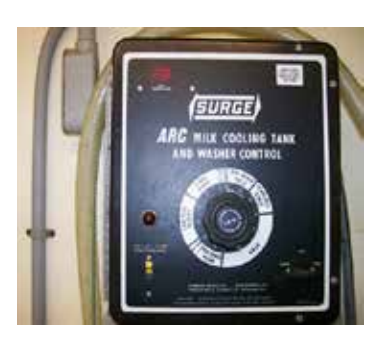
The temperature of the milk in the tank is displayed on this panel.