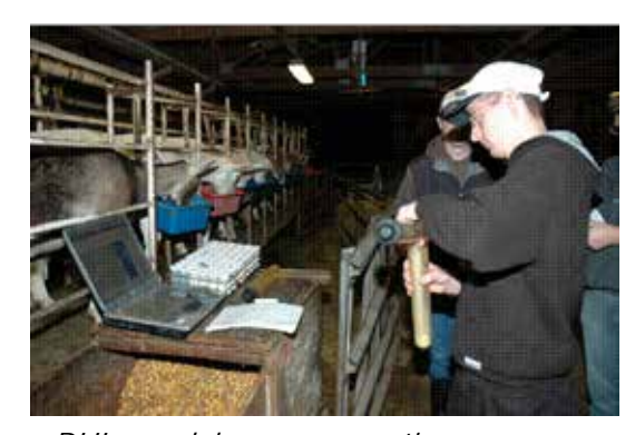
DHI records have many options available to the farm manager.

Good, sound economic decisions are based on good records.