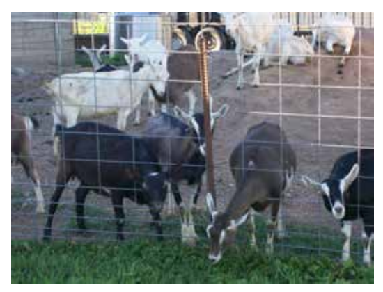
Stock panels work well for fencing goats. The key is to use the correct wire size for the age of the animal that you are working with.

In earlier chapters of this Best Practices Guide the discussion has been about how to manage the dairy goat to maximize your profits. Your facilities will play an important role in the efficiency and ease of your overall operation as well as your daily work. The first thing you will need to decide when planning your building needs is the goal for the number of animals in your dairy goat operation. How many milkers, drys, yearlings, bucks, and kids will need to be housed?