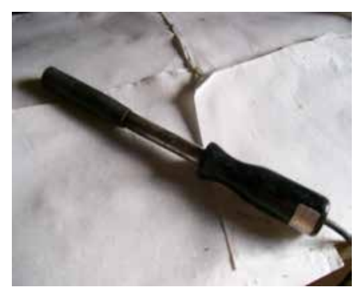
The electric dehorner is used to dis bud kids.

If the goal of the farm is to keep replacements from above average does and sell the extra does a protocol needs to be developed as to how these kids will be identified. Permanent identification