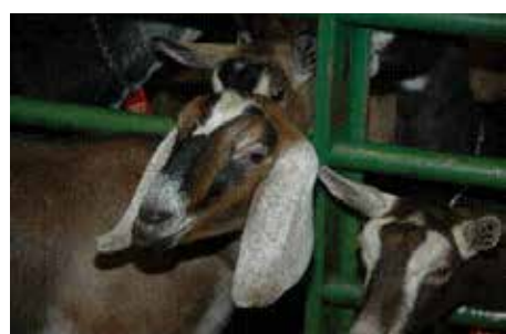
The Nubian has pendulous ears.

The Nubian has pendulous ears that extend at least one inch beyond the muzzle. They come in a variety of colors. Although they produce less milk than other breeds, their milk is high in butterfat and