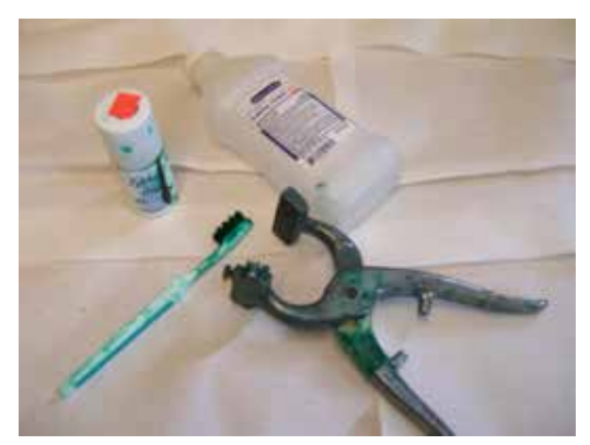
Clean the ear with alcohol, rub on the ink, tattoo the ear, roll on more ink, and then work the ink into the tattoo with a toothbrush.

know how to disbud, work with your veterinarian or another dairy goat farmer to develop this skill. Disbudding kids at this age is a lot less stressful than dehorning them later. Kids are disbudded to prevent injury to other goats and to those who work with the goats. Horned goats are more likely to get caught in fences and feeders.