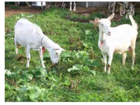
Goats on pasture will eat from the top down.