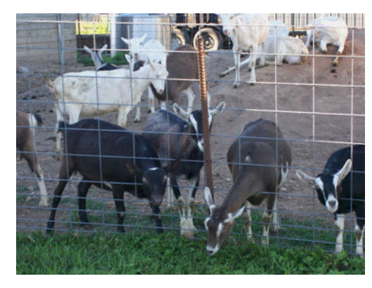
Goats need to be able to get outside to improve their overall comfort.

There are a number of environmental factors to evaluate. Does should not be overcrowded.