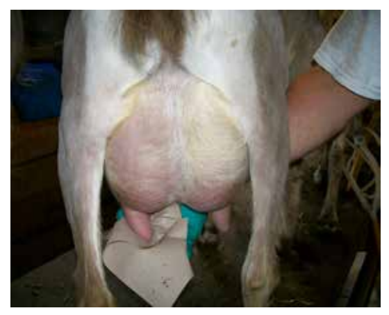
The proper milking procedure is important in producing high quality milk. The udder needs to be stimulated prior to milking to allow the "let down" hormone to take effect. The milker should wear gloves as the gloves have a non-porous surface which does not harbor any bacteria as skin may.

CAUTION: Do not use udder or equipment sanitizers as a teat dip unless they are specifically listed on the label for this purpose. Observe the teats regularly to make sure they are not chapped or irritated.