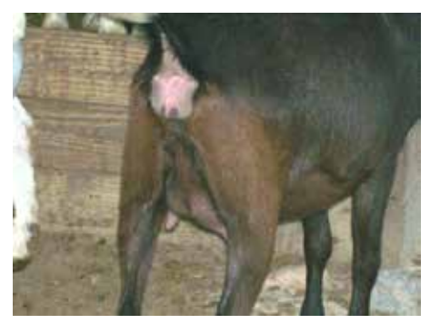
Attention must be paid to the proper feeding of the dry doe.

The transition ration also helps to eliminate the stress of switching from one feed to the next. Having all feeds pelletized will prevent the does from picking up changes that would be in the texturized feeds. The feed nutritionist or consultant can develop feeding protocols for the farm.