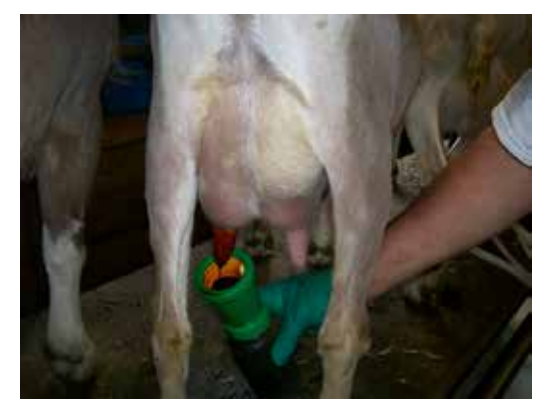
Upon the completion of milking a postdip should be used to prevent bacteria from entering open teat ends.

Teat dipping has been shown to give effective control of the common forms of mastitis. Immediately after milking dip each teat in a disinfectant solution which is specifically formulated for this purpose. Follow directions on