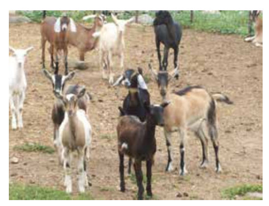
Coat color is a qualitative trait that is affected by only a few genes.

Production and type traits also are affected by environmental factors such as feeding, management, and health. In most cases their influence is greater than inheritance. However,