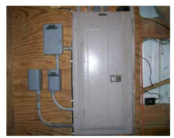
Evaluate your power needs. If your electrical systems need updating, check with your power supply company as they may have some cost sharing programs available that may fit your needs.

A generator may be an investment that should be considered. In case of a power outage, plans need to be in place as to how water will be pumped, goats milked, and the milk cooled.