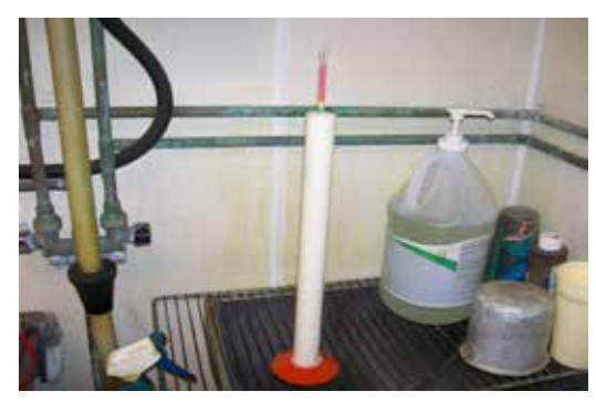
A colostrum meter is used to test the level of antibodies in the colostrum. Before colostrum is pasteurized it should be tested.

( Note: if you get your colostrum from other farms, the antibodies won't be for the same strains of diseases on your farm.)