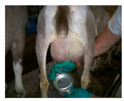
Health issues can be identified with the use of a strip cup.

Step 1. Pre-dip. Use a commercially prepared high quality dip 0.5% iodine or other approved product. The teat should be debris free. The pre-dip should cover the teat about 3/4 of the way up the teat. The dip needs to remain on the teat for 30 seconds. Research shows that effective predipping reduced bacterial counts in milk by 5 to 6 fold and reduced the risk of isolation of listeria by 4 times. (Hanssen et al. 2001.)