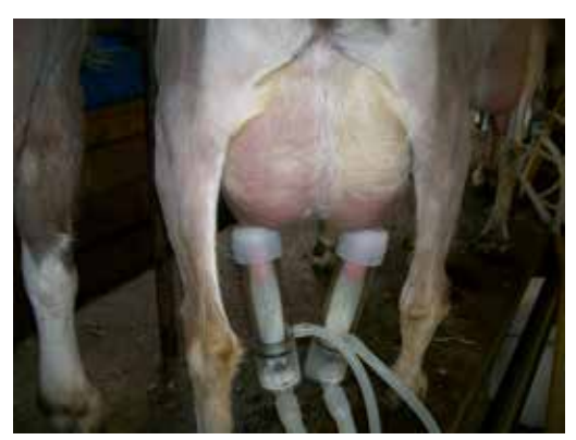
When selecting a milking machine, watch to see that the milk is quickly removed from the teat end. Shorter stemmed inflations improve milk-out rates in goats. Silicone inflations are more expensive, easier on the teat ends and lasts longer than rubber.

the vacuum pump is that it possess adequate capacity (cubic ft./min.) at the operational vacuum level. Manufacturers can provide CFM ratings for various vacuum pumps or the CFM delivery can be determined by the use of a flow rate meter.