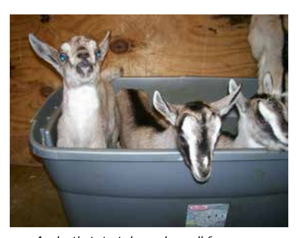
A plastic tote tub works well for new born kids. The tub is easy to clean and sanitize.

Steps four and five can be completed while the colostrum is either being heat treated or a frozen bottle is thawing. Line the bottom of a large plastic tote tub with shredded paper. Place kids in