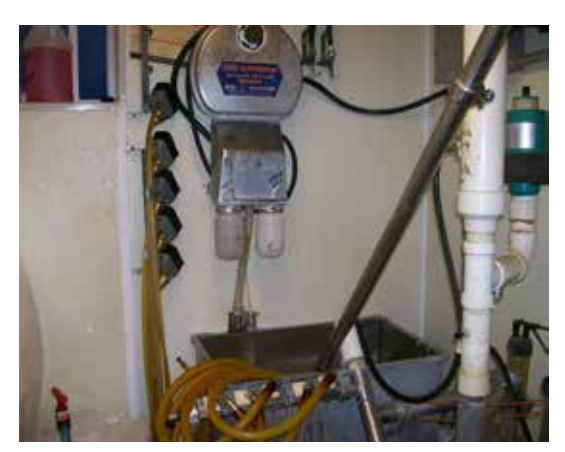
The milking units are brought into the milk house and placed on this automatic washing system. The system washes the units as well as the pipeline automatically. The detergent and acid cleaner are placed in the plastic jars according to manufactures recommendations. Just before milking the system sanitizes the units and pipeline.