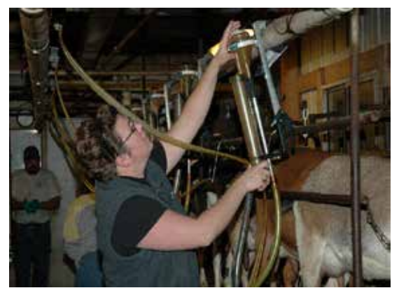
Ag Source provides testing for the Milk Urea Nitrogen (MUN) levels in your milk. Check with your local technician for details on this testing service.

As a rule of thumb, if the manure is dark and runny, then the MUN is high.