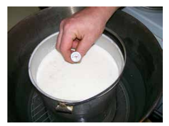
Before the milk is removed from the pasteurizer take the temperature of the milk to assure it has reached the correct temperature.

chances of survival are severly reduced.