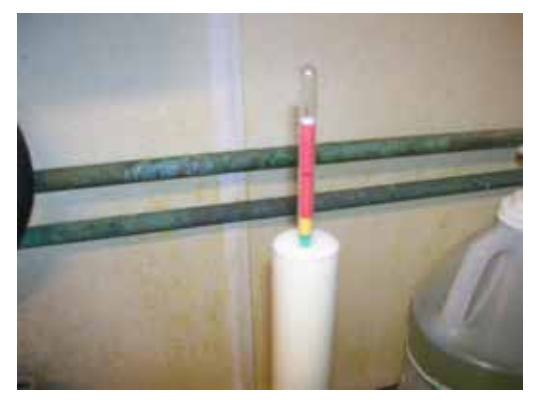
There are three readings on the meter in which the colostrum may fall. If the meter is green the colostrum once pastuerized may be fed to the kid. If the meter is red there are not enough antibodies in the colostrum and it should not be fed to the kid. Colostrum in the yellow reading is marginal.

The colostrum should be bottle-fed to the newborn to insure adequate consumption. The doe should be milked as soon as possible after parturition. Use a colostrum meter to test the level of antibodies in the colostrum. If the colostrum has a low level of antibodies it should not be used. Feed 1 ounce of colostrum per pound of body weight three times during the first 24 hours. An 8 pound kid should get 8 ounces every 8 hours. (Mary Smith, DVM "Managing Kidding & Lambing", 2005 Cornell Sheep & Goat symposium.)