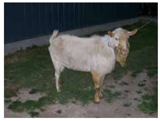
More genetic progress can be made in a herd if the concentration of the efforts is on the selection of the buck.

Again, the first step in the selection process is to define the goals of the program; e.g. which traits are desired in selection. The appropriate records