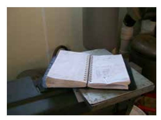
The key to an effective record keeping system is to develop a system that is handy and easy to use.

The first step in developing a quality herd health program is to work with your veterinarian to develop a herd health plan. Putting together a plan for the year will help to keep the herd on schedule for the necessary management practices. Sanitation and timely management practices such as disbudding, dehorning, worming when necessary, and vaccinating on a set schedule will help prevent illnesses and other health issues.