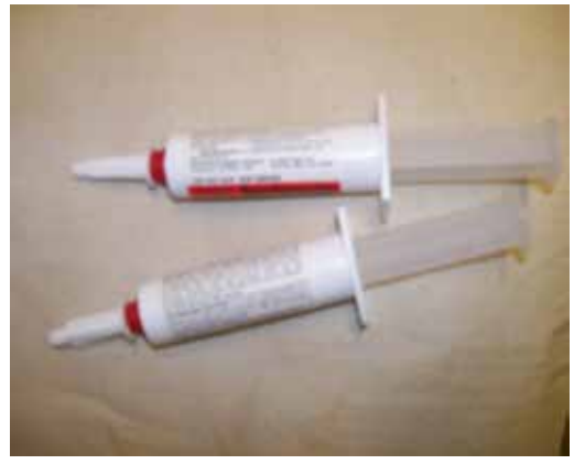
Antibiotic udder treatments available are excellent for treatment of infected mammary glands, but success with their use is determined by the level of milking management and sanitation used in milking the herd.

Mastitis in dairy goats is usually the result of