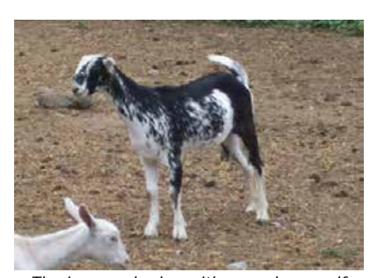
The Lamancha has either gopher or elf ears.

The French Alpine , also known as the Alpine dairy goat, is a medium to large size animal with erect ears and numerous color variations. They are very hardy, maintaining good health with excellent production. They are very adaptable and their kids tend to be very aggressive eaters.