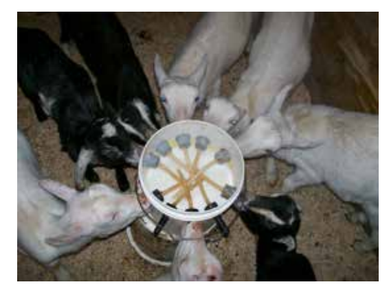
Measure out the exact amount of milk and / or milk replacer when using a lamb bar so kids are not overfed. The lamb bar does save time when feeding kids.

Once the kid is suckling from a bottle they should be transferred to a lamb bar or an automatic feeder. If feeding a large number of kids on a regular basis an automatic feeder may be an economical choice for your farm. Milk replacer is automatically mixed on an as needed basis. Thus the kid can eat whenever it wants to. The manager needs to keep a close watch to be sure all kids are drinking.