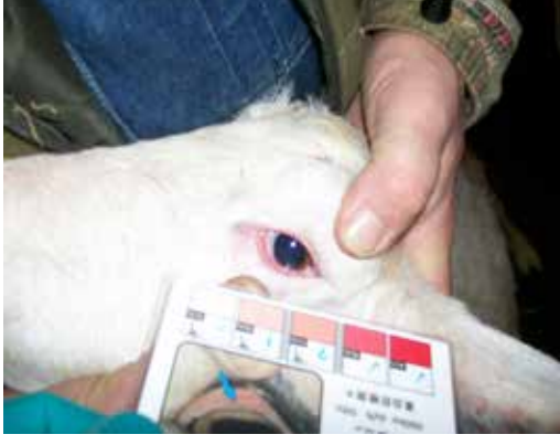
With the use of the FAMACHA Card the farm manager can quickly evaluate does. Based on the color of the mucus membrane of the eye a decision can be made as to whether or not the doe needs to be wormed.

of the most pathogenic gastrointestinal parasites of goats. They are best controlled by strict management procedures which include drug treatment,